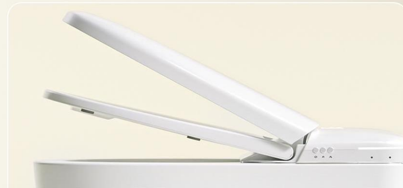
SLOW DAMPING COVER PLATE