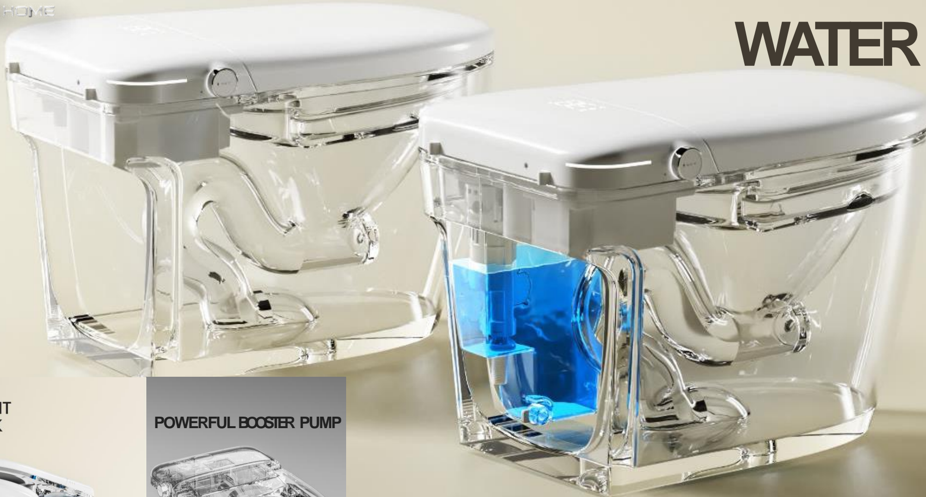
INDEPENDENT WATER TANK