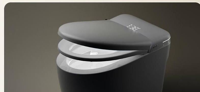
SOFT NIGHT LIGHT