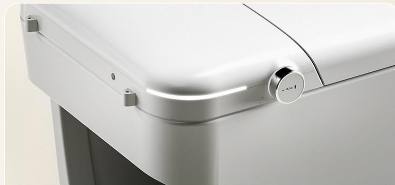
REDUCED ATMOSPHERE LIGHT